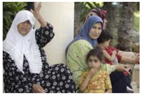
Among the objectives of Jihad in Islam is saving weak people from injustice

In the fourth section of the valuable book Fiqh of Jihad, the erudite scholar Sheikh Yusuf Al-Qaradawi tackles the objectives of jihad in Islam. This section includes five chapters which deal with the following topics: