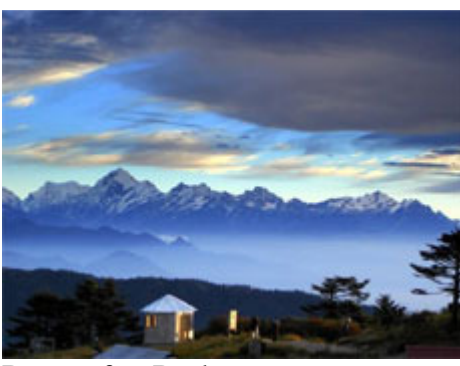
Dawn after Darkness