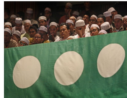
PAS is seeking to enforce hudud in Kelantan, a move which an Islamic scholar says is possible through amending the Penal Code.

Published: 11 May 2014 | Updated: 11 May 2014 2:31 PM